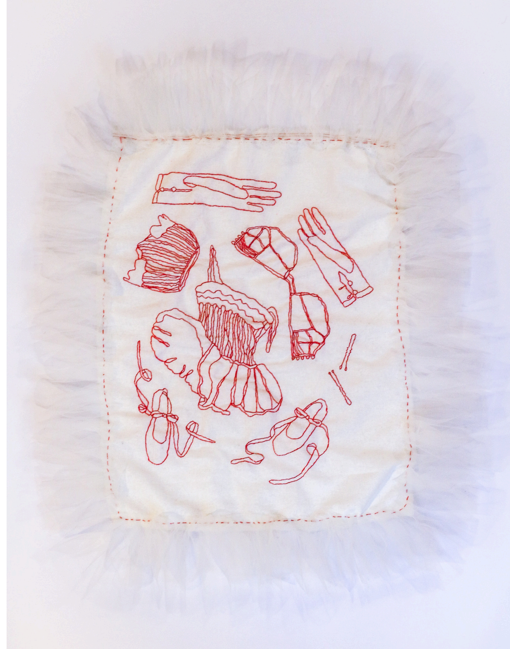
Spectacle Night, 2025-2026: embroidery on fabric and tulle 52 x 44 cm (available)