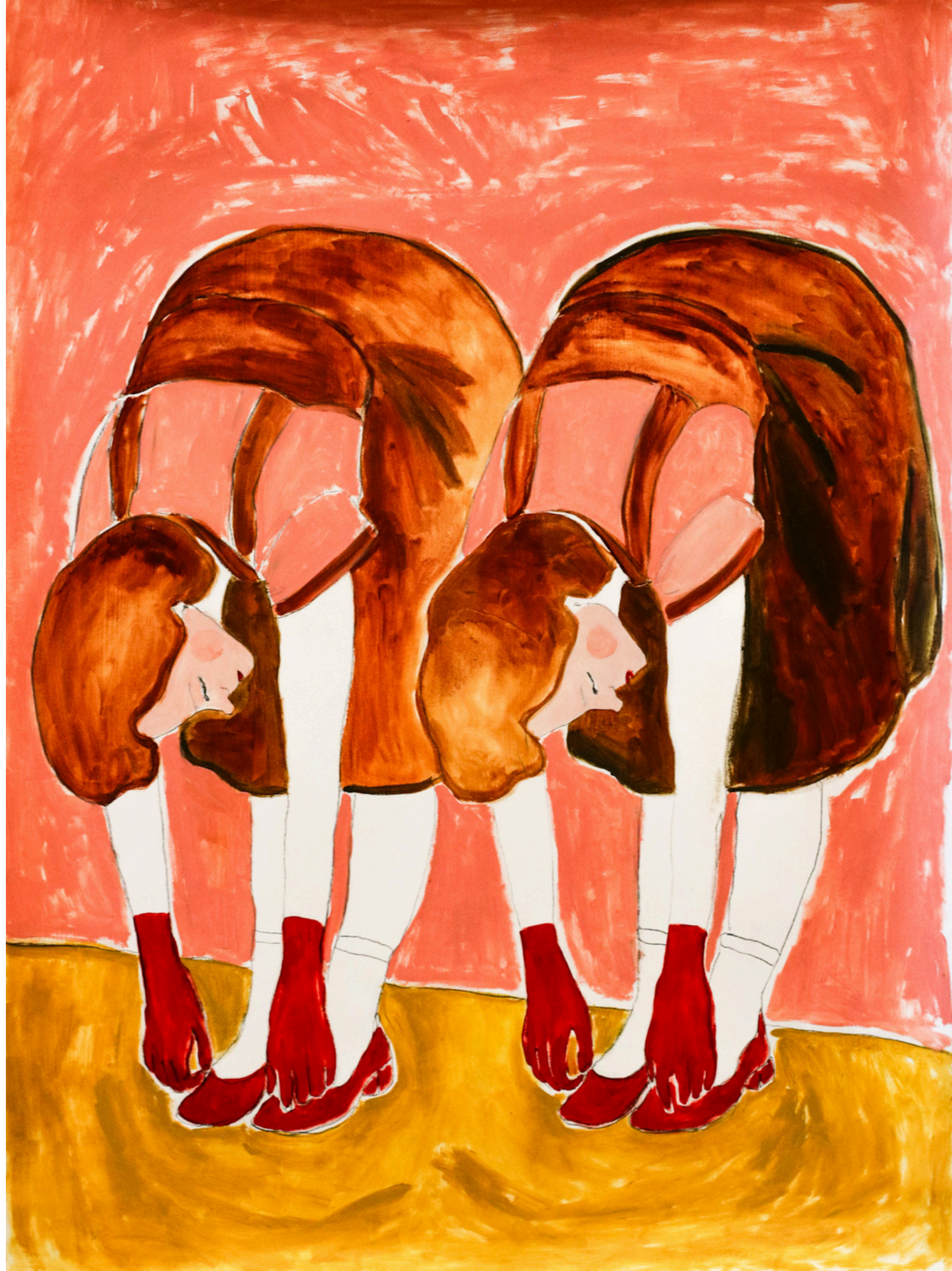
Devotion, 2026 oil on Fabriano paper 78 x 58 cm (available)