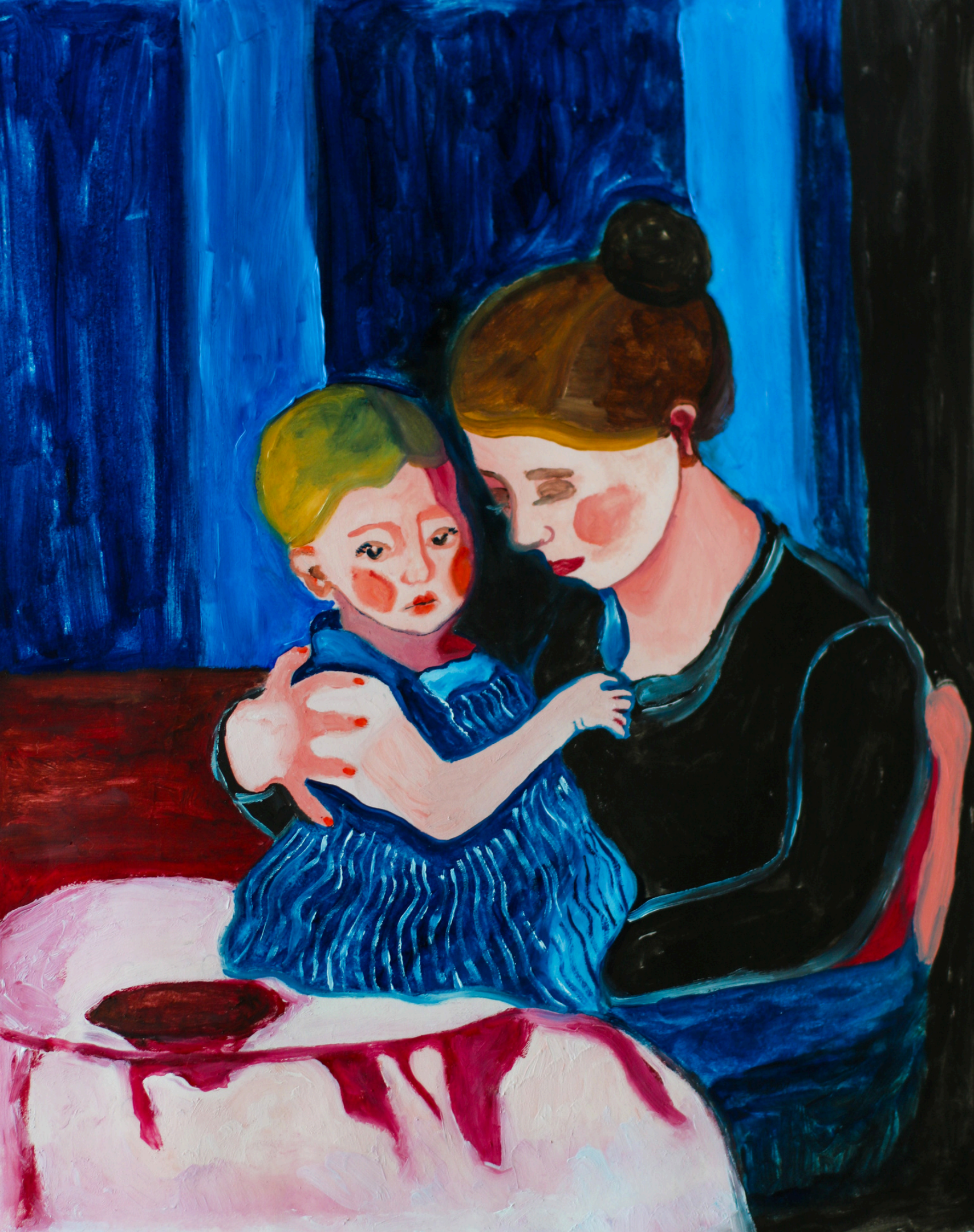
Paintings for the Jane Austen's book - Antofágica oil on paper