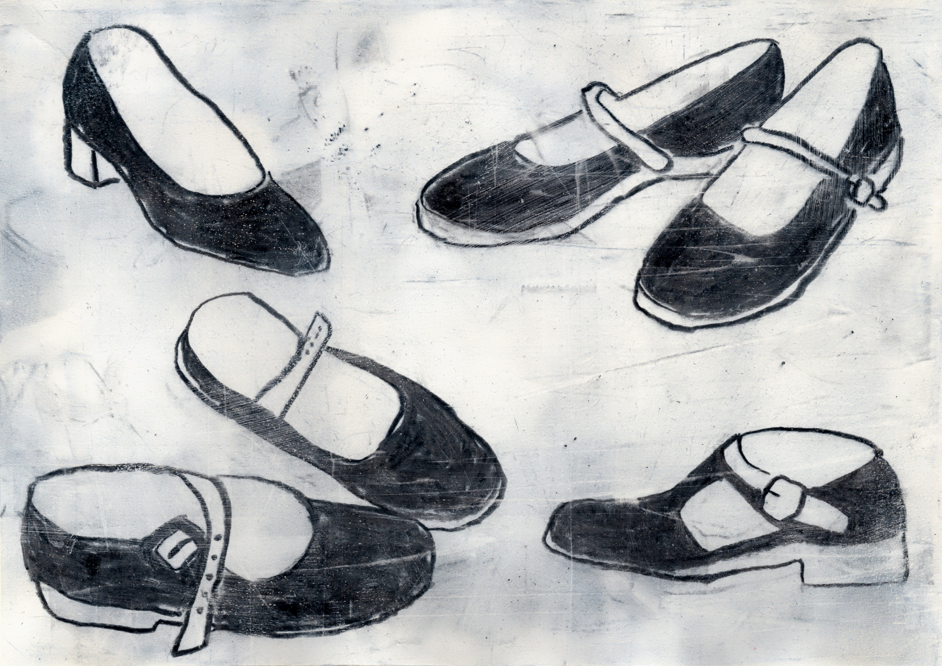
Spectacle Night, 2025 Charcoal monotype on paper A3 (available)