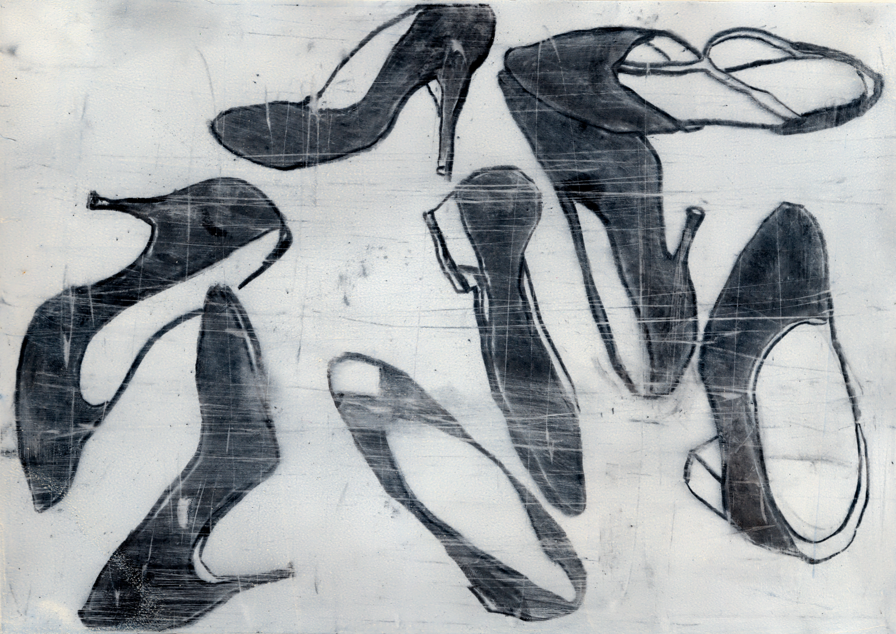
Spectacle Night, 2025 Charcoal monotype on paper A3 (available)