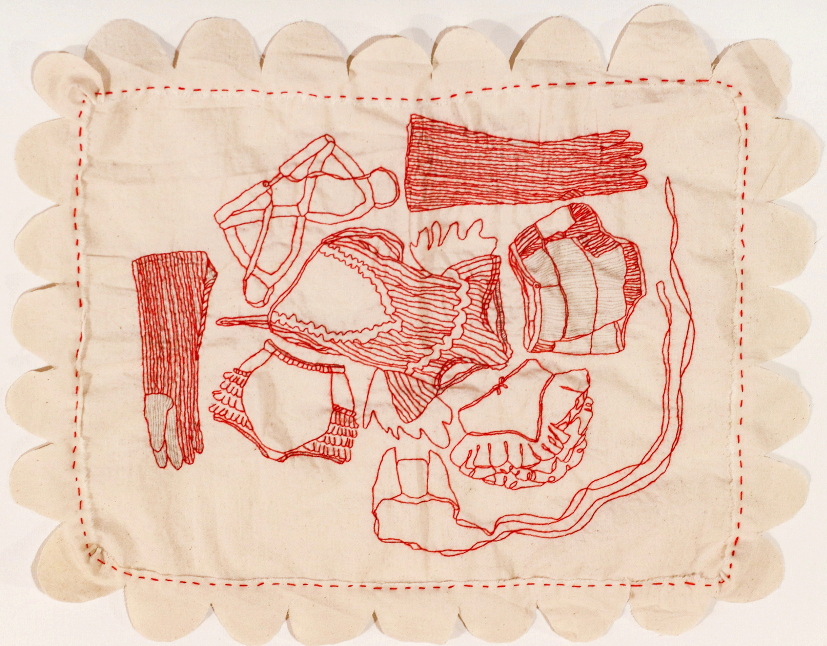
Spectacle Night, 2026 embroidery of costume design drawings 50 x 40 cm (available)