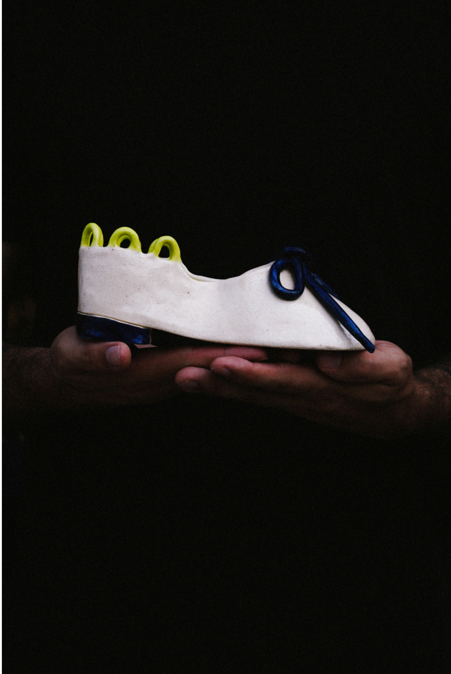
2025 handmade ceramic little shoes, high-fired and glazed